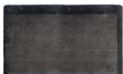
9 DIBBETS CAMBRÉ RUG CM 400X400